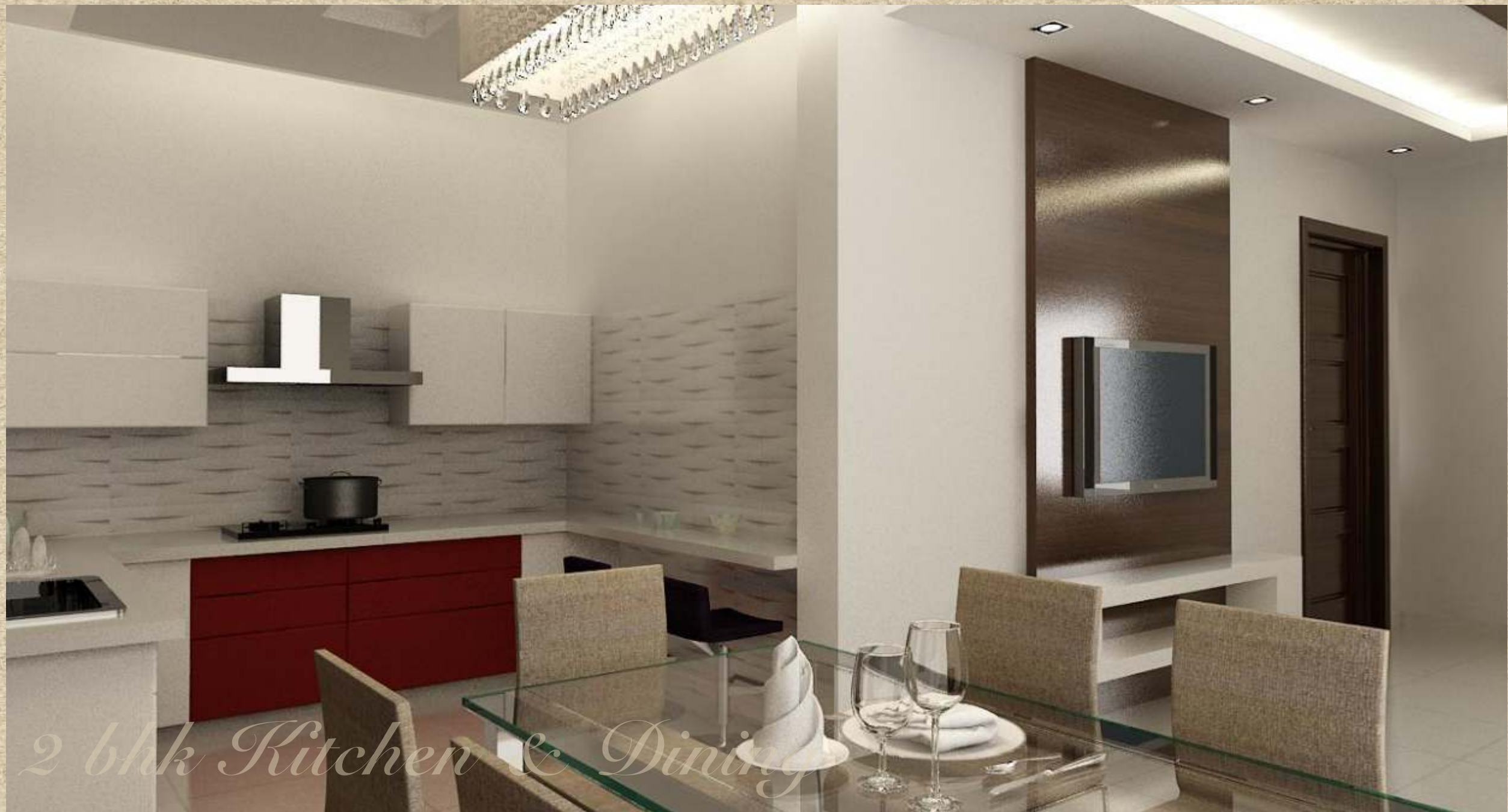
2 bhk Kitchen & Dining