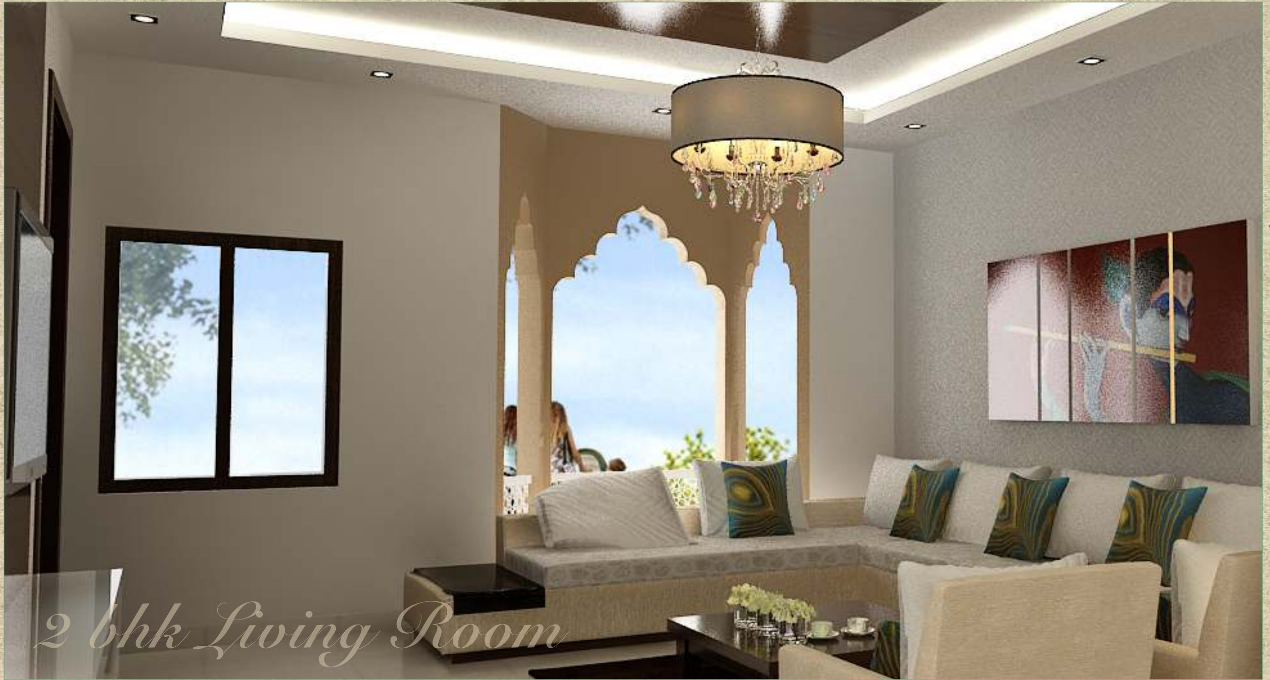
2 bhk Living Room